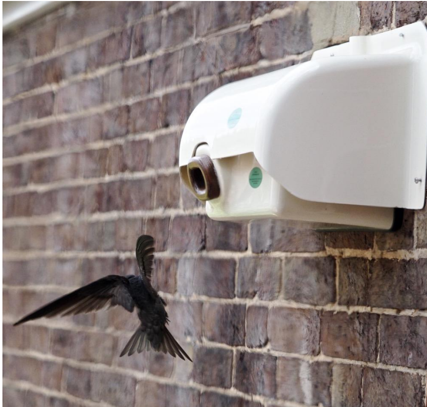
A Swift approaches its nest in an Impeckable nest box fitted with a sunshade

Congratulations! You have bought a nest box and want to help Swifts!