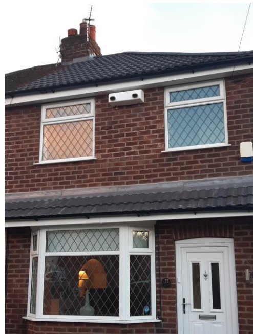
Quadruple and Double Impeckable nest boxes installed on private dwellings